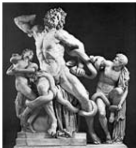
Laocoon and his Sons, 25 BC, Vatican Museums, Vatican City

Warburg, when describing the classic marble group known as the Laocoon, identified transition as a fundamental element to turn a static image in movement charged with pathos. Several years later, the Russian movie director Ejzenstejn, when commenting on the same Laocoon sculpture, wrote that the lived expression of human suffering portrayed in this masterwork of classic art is accomplished by means of the illusion of movement.