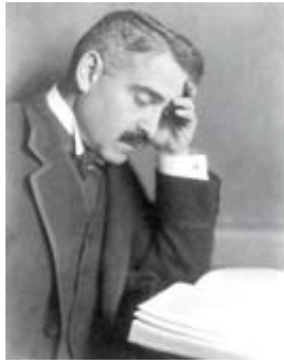
Aby Warburg, 1866-1929

main creative sources of artistic style. According to Warburg, a theory of artistic style must be conceived as a "pragmatic science of expression" ( pragmatische Ausdruckskunde ).