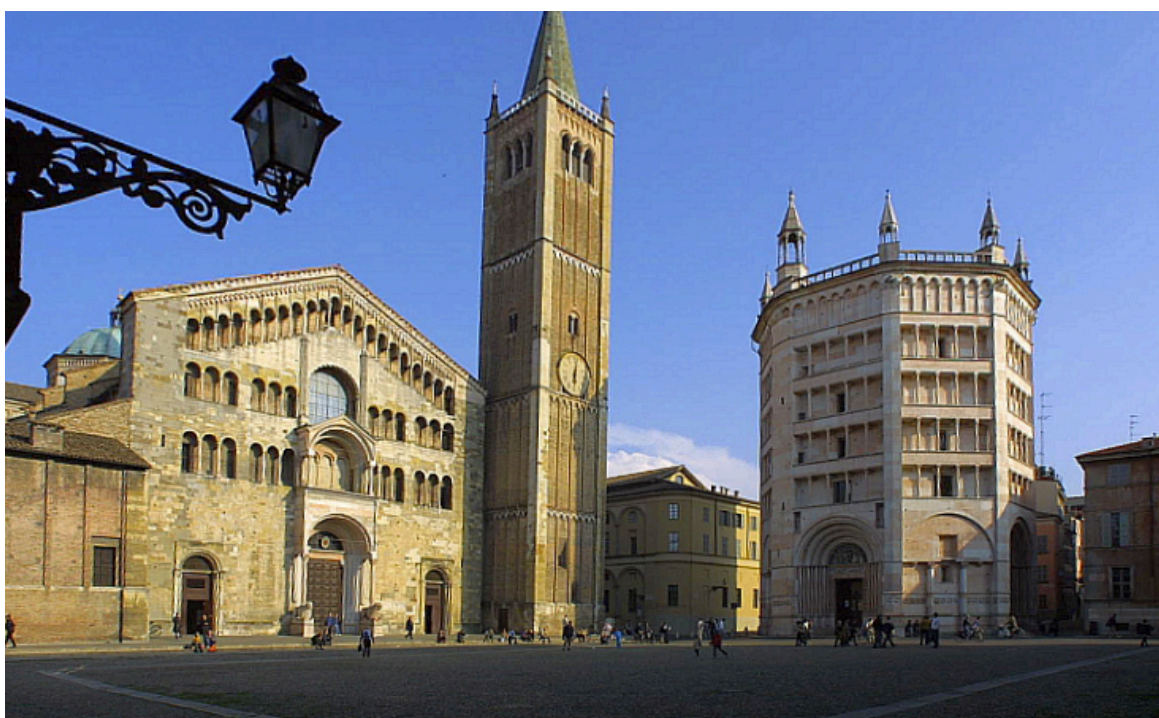
Parma, Cathedral and Baptistery